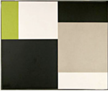
John McLaughlin Untitled 1952 Greenberg Van Doren Gallery