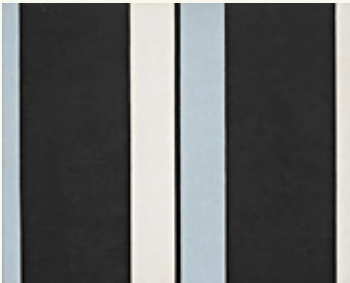
John McLaughlin Untitled 1962 Greenberg Van Doren Gallery