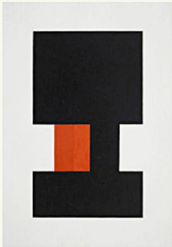
John McLaughlin L-1958 1958 Greenberg Van Doren Gallery